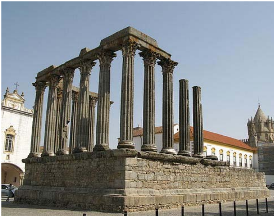
The Roman Temple of Diana

Évora has been shaped by some 20 centuries of history, going as far back as Celtic times. It fell under Roman domination, when it was called Liberalitas Julia and, among other ruins, still retains those of the Temple of Diana. During the Visigothic period, the Christian city occupied the surface area surrounded by the Roman wall, which was then reworked. Under Moorish domination, which came to an end in 1165, further improvements were made to the original defensive system as shown by a fortified gate and the remains of the ancient Kasbah. Moreover, the toponymy is indicative of the Maghreb population, which remained after the reconquest in the La Mouraria quarter of the north-east.