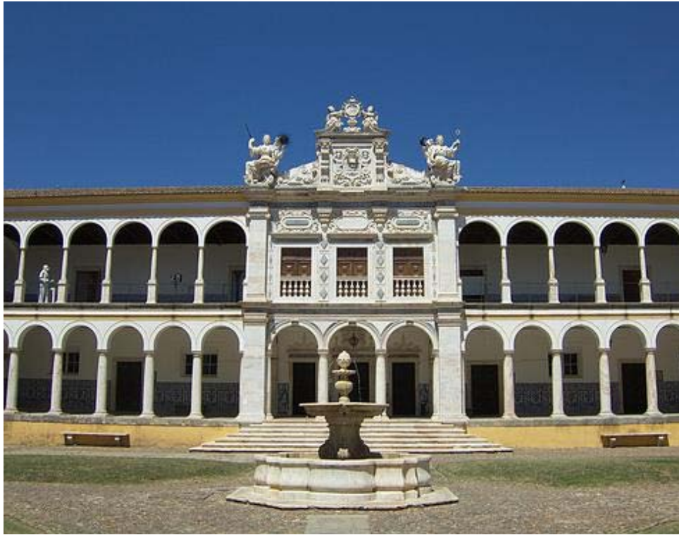
University of Évora – Claustro do Espírito Santo

Wrought iron and azulejo decoration, which is splendid in the convents and palaces and very charming in the most humble dwellings, serves to strengthen the fundamental unity of a type of architecture which is perfectly adapted to the climate and the site.